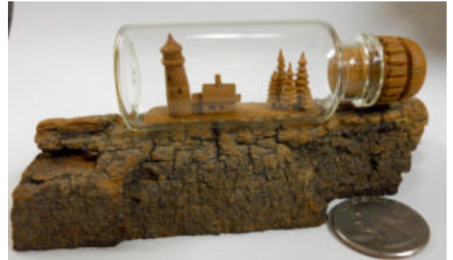
Display: Gary Bityk