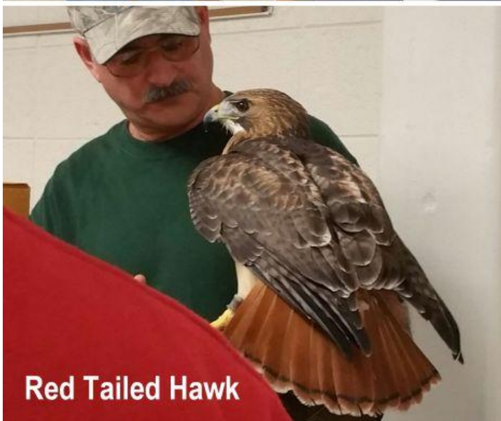
Red Tailed Hawk